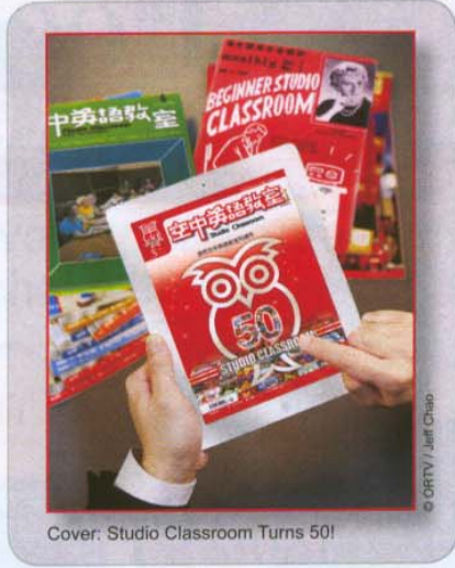
Cover: Studio Classroom Turns 50!

Visit StudioClassroom.com and watch our Topic Talks videos